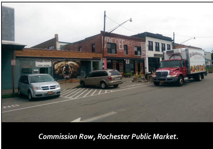
Commission Row, Rochester Public Market.

In addition to food distribution hubs as solutions for high transportation costs, there could also be an analysis of the New York State Thruway to provide quantitative and qualitative estimates of its economic impact to New York State and the Region as well as estimates of the time savings and other benefits such as fuel efficiency. A report conducted by Jacobs Civil Consultants, Inc. in May 2012 does provide an economic assessment of the investments and operations of the New York State Thruway Authority. For