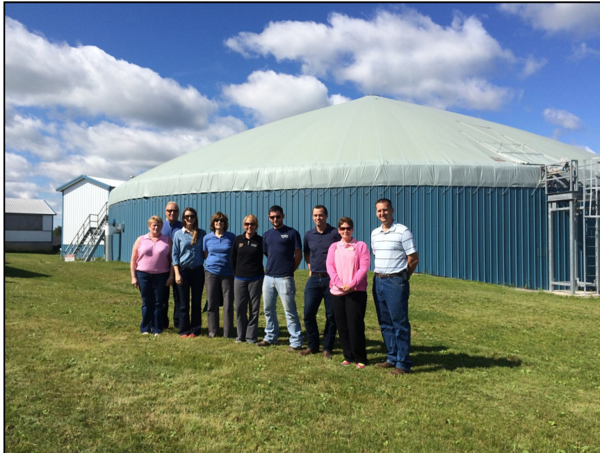
Anaerobic digester.

Mitigation strategies applicable to this project include: