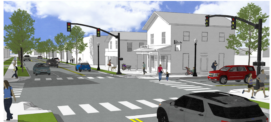
The report contains several visual graphics to convey potential redevelopment scenarios for locations in the Hamlet, such as the Four Corners shown above.

The two 'priority projects' to indicate that their implementation should be prioritized more highly upon completion of the plan. As 'priority projects' these two projects include timeframes that are more immediate and additional details such as project phasing and more detailed cost estimates.