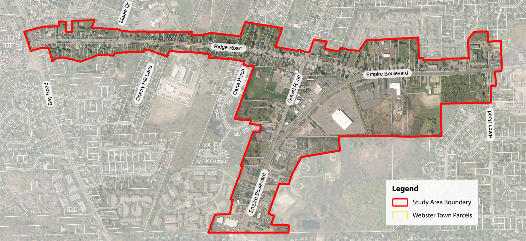
Figure 1: Hamlet Revitalization Boundary